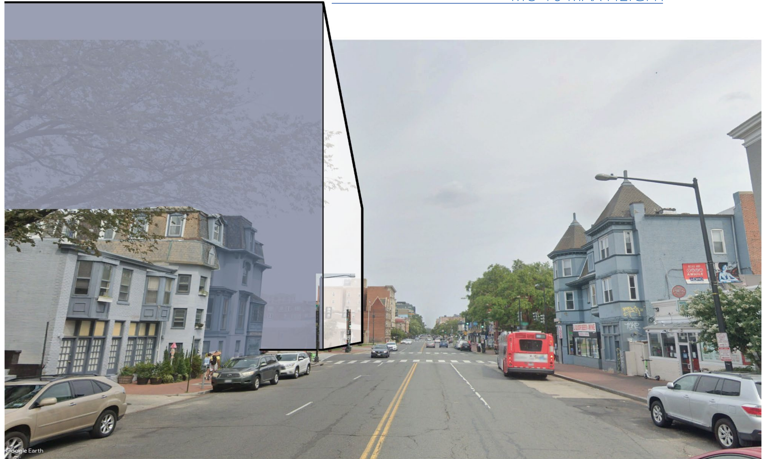
U STREET FACING EAST